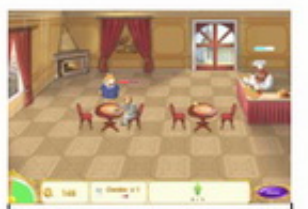
Bilbo The Four Corners Of The World