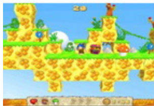
Carl The Caveman