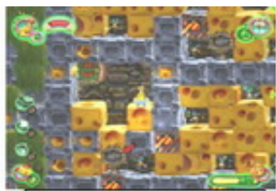
Beetle Bug 3