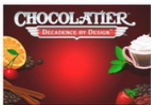
Chocolatier Decadence By Design