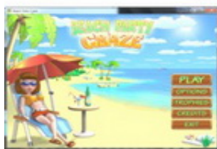
Beach Party Craze