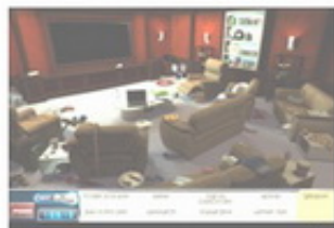
CLUE Accusations And Alibis