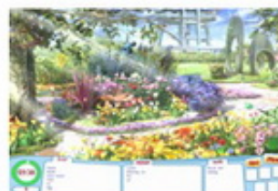
City Sights Hello Seattle